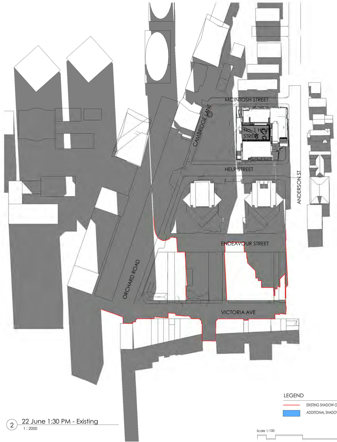
2 22 June 1:30 PM - Existing 1 : 2000

LEGEND — EXISTING SHADOW OUTLINE — ADDITIONAL SHADOW